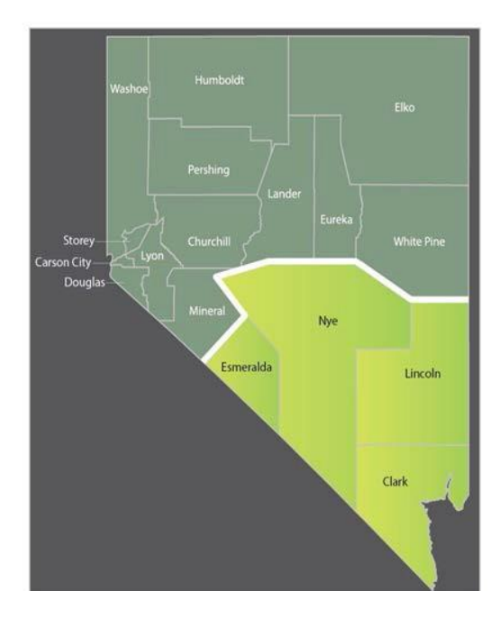
Nevada's Designated Workforce Development Areas (Southern Nevada's Workforce Development Area is highlighted in light green)

This four-year local plan reflects Workforce Connections' (WC) goals and strategies to comply with the the requirements of Workforce Innovation and Opportunity Act (WIOA). It aligns WC's resources with the goals of the Governor's Workforce Development Board in alignment with the Nevada Unified State Plan. This plan ensures alignment of education, career training and workforce development services to achieve targeted objectives. WC's vision of integrating the local area workforce development system in support of Nevada's key industry sectors is highlighted throughout this document. This proposed four-year local plan covers the period of July 1, 2020 through June 30, 2024.